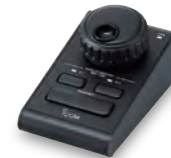
RC-28 Remote Encoder